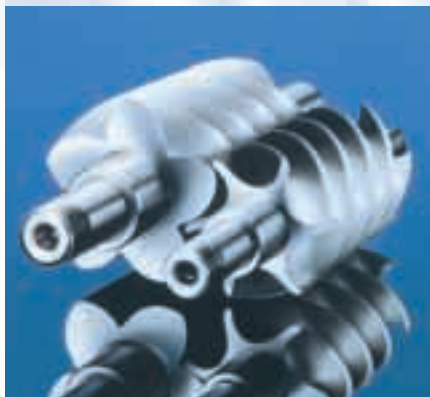
The CompAir screw profile - the result of continuous research and development