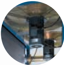
Plant cooling fan. The cool air passing through the fan picks up radiant heat

Cooling is achieved with an independent, motor-driven fan. Cold air passes over the inside of the plant picking up radiant heat so there is no temperature build-up under the canopy. This allows for safe operation in the most arduous conditions.