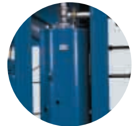
Large reclaimers with generously-sized fine separator elements, large oil coolers and aftercoolers

CompAir employs only the very best manufacturing techniques - a guarantee for reliability and performance