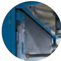
The large after-cooler effectively cools compressed air to a low 5°C above ambient (dependent on model)

A large surface after-cooler gives the benefits of: