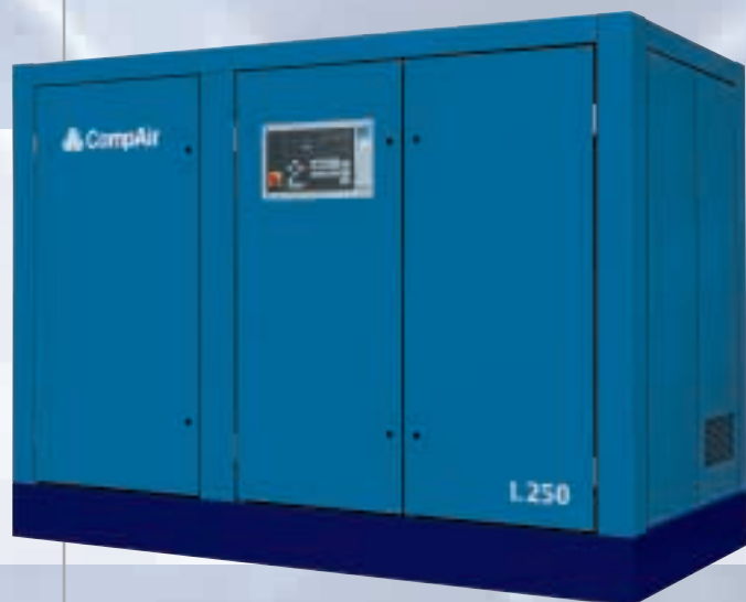
The CompAir L Series. A high capacity air compressor range that sets the highest standards in reliable, economic and efficient operation.